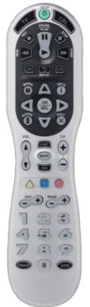
Polaris Big Button Remote