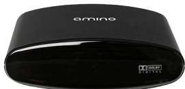
Amino 140 or 540